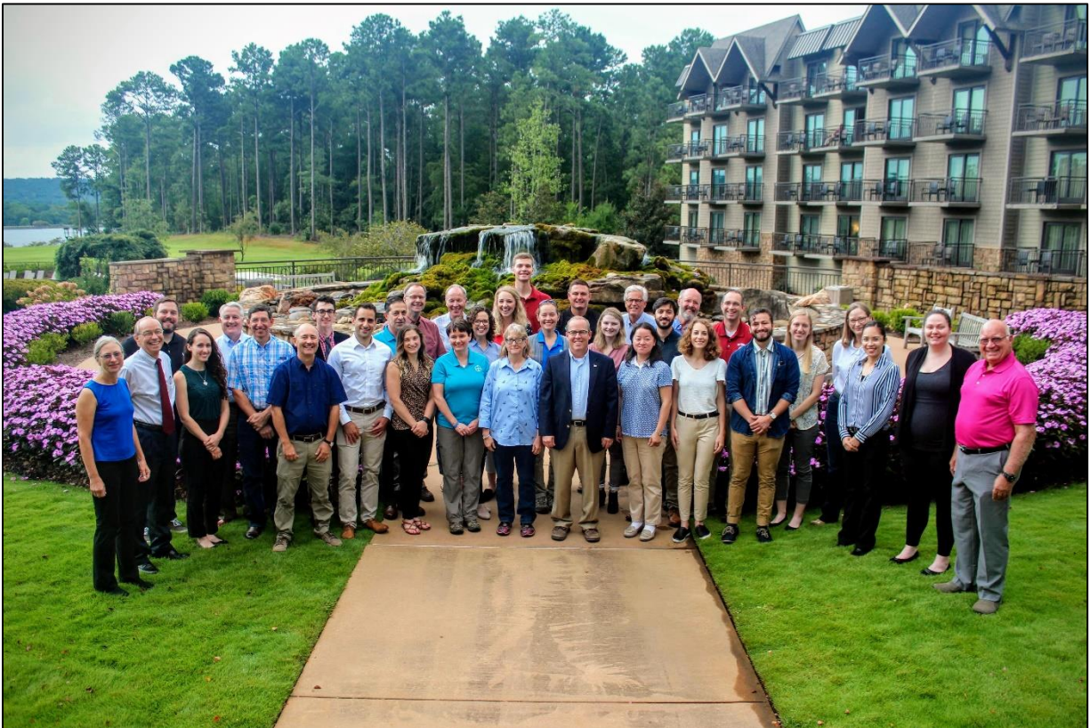
2019 Class of NAPB Borlaug Scholars with their Mentors in Callaway Gardens, GA