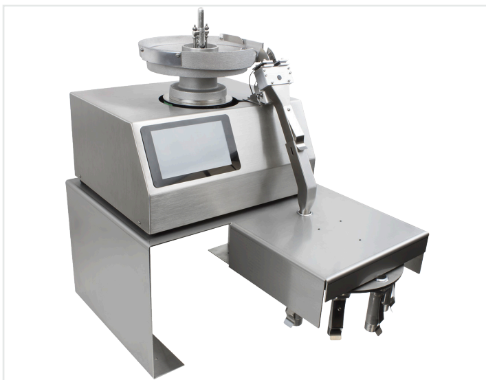
Isometric view of Count-A-Pak® featuring optional carousel