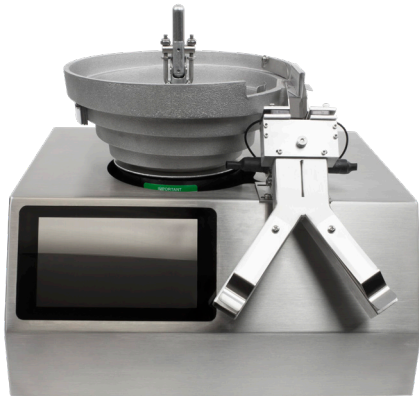
901 Count-A-Pak® featuring dual chute