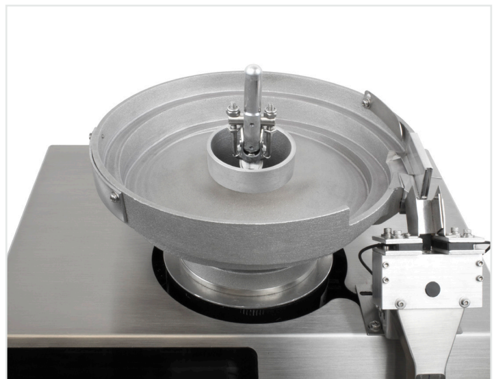
Close-up of shallow bowl top on a single-chute unit