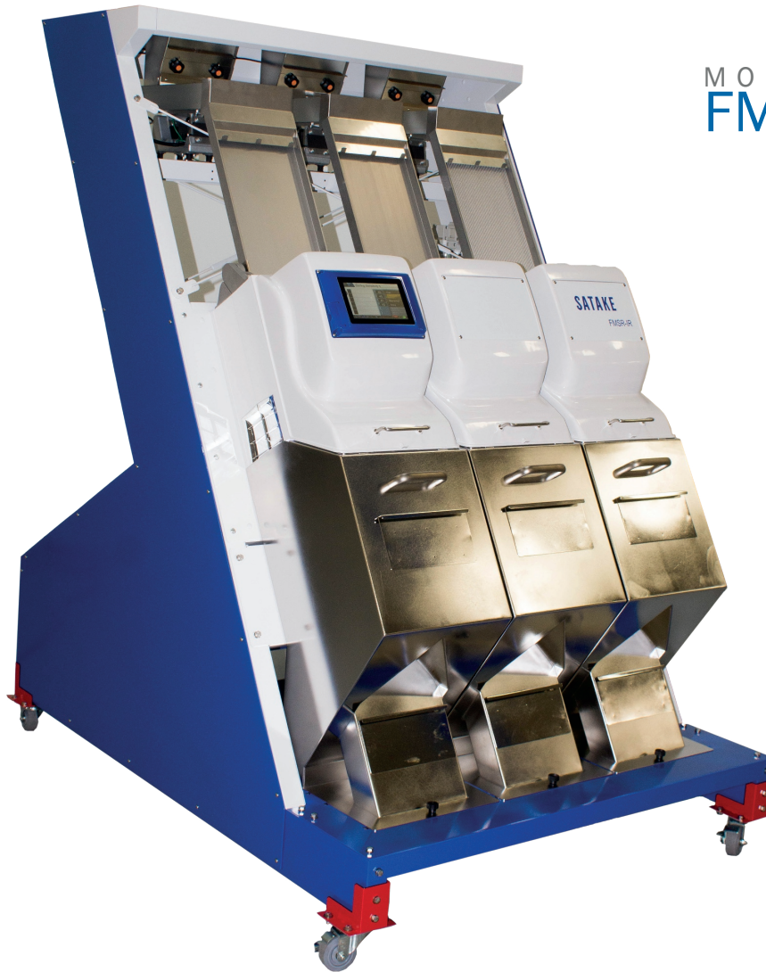
MODEL FMSR-IR (3 chutes)

The FMSR-IR is an efficient midsize sorter that features Full Color RGB + Shape + Infrared technology. It is ideal for sorting products such as dry beans, corn, nuts, coffee, seeds, plastics and multiple varieties of grain as well. The FMSR-IR features patent-pending Satake software assuring quick set-up and hassle-free operation. Behind every optical sorter is the assurance of Satake's premiere after the sales support and customer service.