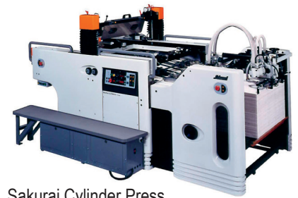
Sakurai Cylinder Press

6 Color UV Carousel Screen Printing Press - Image Area 40in x 61in 5 Color UV Carousel Screen Printing Press - Image Area 38in x 50in Sheet Size 40.25in x 28.3125in Image Area 34.5in x 49in with Hypron A-LE 2+2 with 2 Lamp Curing System Image Areas that Go Up to 34in x 50in